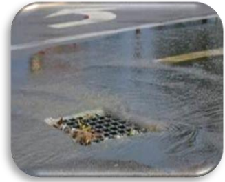
Photo: Road stormwater collection